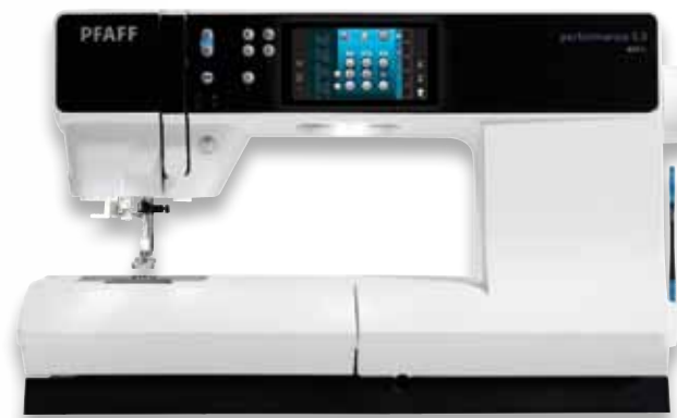
Exceptional space for large amounts of fabric.

Just one touch and the machine ties off, the presser foot is lowered or lifted automatically, the upper and bobbin threads are cut, the feed dogs are lowered ... when you want it to happen.