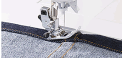
3-12-3 Layers of Denim